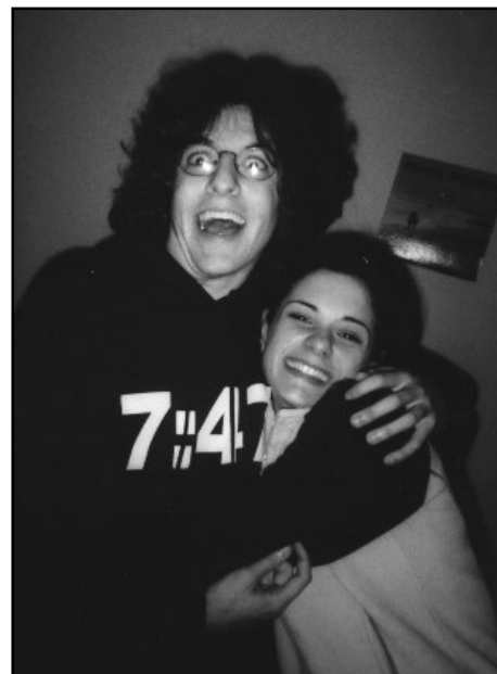
Oh no! It's a BeSTY lock-in!

Sunday May 23 rd : A city wide Jewish comedy fest sponsored by the JET program