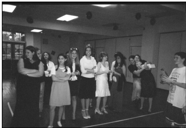
The movie stars assemble for their walk down the runway.